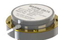
MD54 Compass Sensor Adhesive Mount (available separately) SKU F054001*

MD52A/B sensor mounts underneath the ship's compass bowl using mounting MD54 or MD58 (available separately, depending on the host compass type)