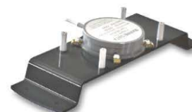
MD58 Compass Sensor Bracket Mount (available separately) SKU F058001*

*One sensor mount is a required option (available separately) - depending on the type of host magnetic compass; please contact Marine Data to obtain the correct mount.